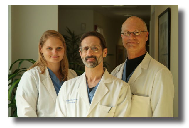
Barnaba, NP Demanes, MD Hill, MD

HDR brachytherapy is proven to be effective for the treatment of local disease in many forms of cancer including prostate , gynecologic , breast , head and neck , esophagus , lung , anal/rectal , bile duct , sarcoma , and other primary cancers or localized metastasis as reported in medical literature. CET's findings on prostate cancer, for example have demonstrated 90% 10-year tumor control for HDR/EBRT combined therapy and a 96% 5 and 8 year diesease free survival rate for HDR monotherapy. Success rates for other tumors vary according to the type and stage of cancer being treated.